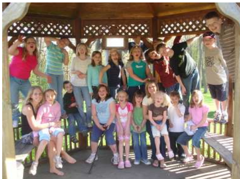
Rock and Good News Gang Group Photo