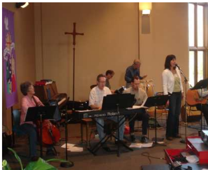
Thanks to the United Methodist Church Band for playing at the Confirmation Celebration!